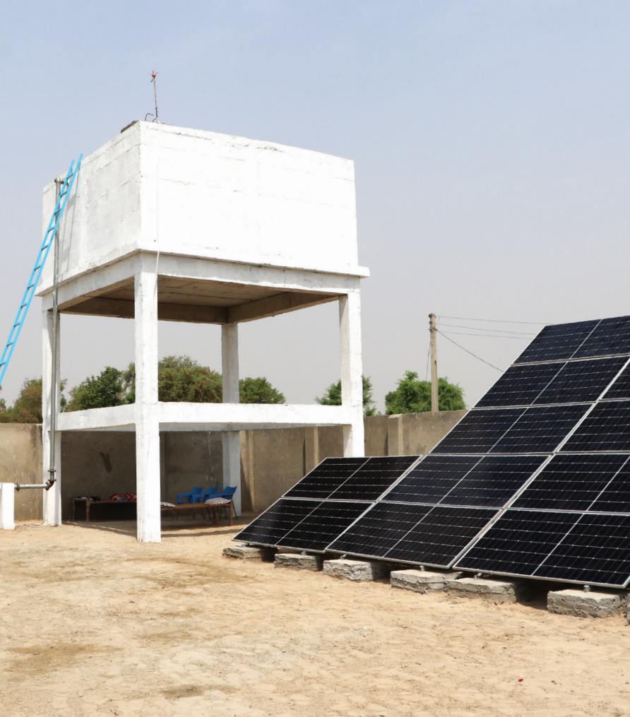
Solar powered clean drinking water supply scheme built through the LACIP-II, in Lakki Marwat Khyber Pakhtunkhwa.

LACIP is an integrated poverty reduction programme funded by Federal Republic of Germany through KfW that aims to contribute towards the improvement of living conditions of vulnerable communities by building disaster-resilient Community Physical Infrastructure (CPI) and generating employability through Livelihood Enhancement and Protection interventions with Institutional Development as the basis for all the activities. PPAF is the lead implementing agency of LACIP through its Partner Organisations (POs).